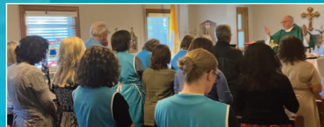
Training with Colorado Springs

Nebraska is the training center for all Mater Filius branches in the United States. We recently hosted the newly formed team from Colorado Springs for two full days of training. We started the training off with Mass on Monday morning. What a beautiful sight to see our chapel full of men and women dedicated to our mission: Defending Life with Love!