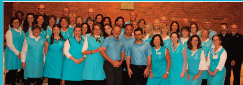
US National Conference

Mater Filius US hosted their National Conference at St. Columbkille Parish in Papillion. We were treated well and are thankful for the hospitality. The theme of the conference was "Fidelity of Mary to the Will of God". There were many great speakers and many opportunities for training and spiritual growth.